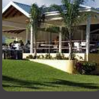
Windsor University School of Medicine