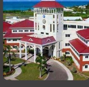
Medical University of the Americas