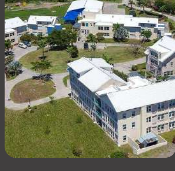
Ross University School of Veterinary Medicine