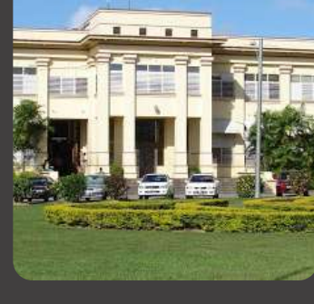
The University of the West Indies

13 college/university campuses, notably: